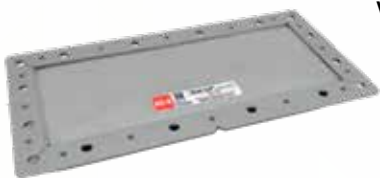
VSP-L flat profile vent.